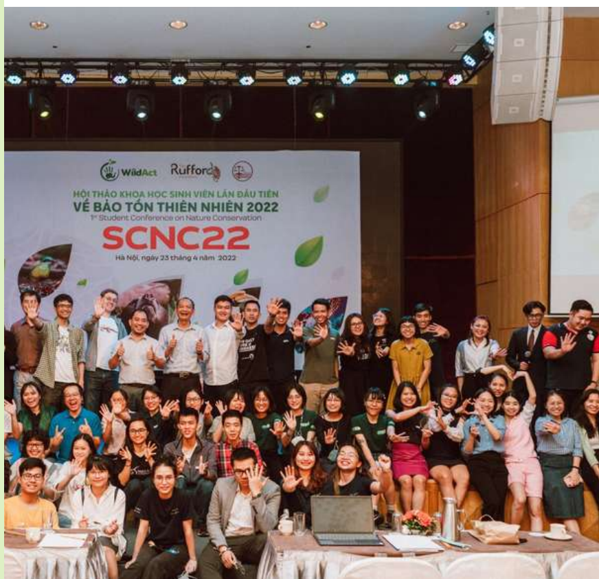
Participants of the first-ever Student Conference on Nature Conservation