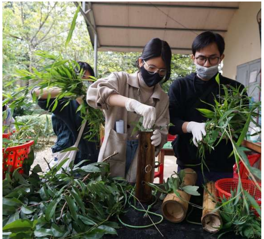
Students prepare feeding enrichment for small carnivores at Save Vietnam's Wildlife rescue centre