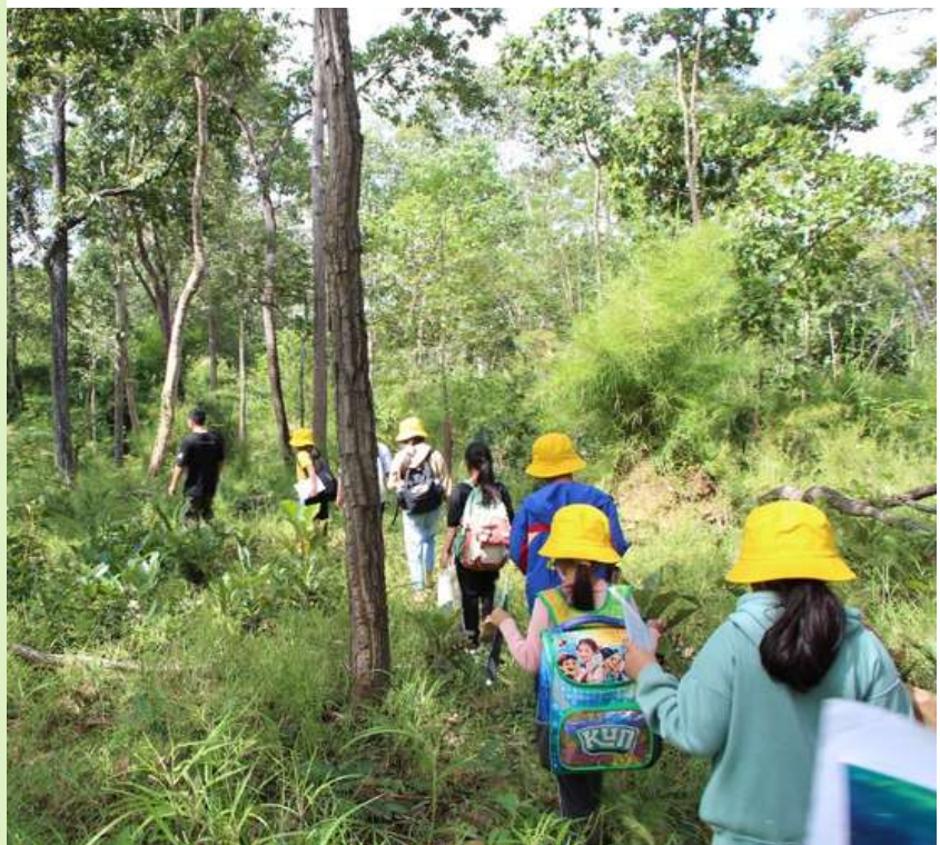
Students from Nguyen Thi Minh Khai primary school enjoying a day out observing wild elephants in Yok Don National Park