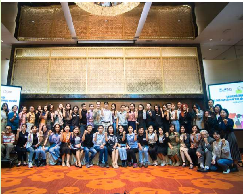
Participants at our first training workshop on Gender-based violence in wildlife conservation sector.