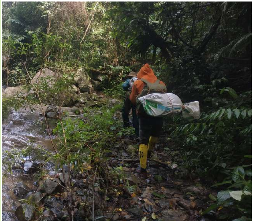
Community members patrolling Chu Yang Sin National Park with park's rangers & WildAct officers.