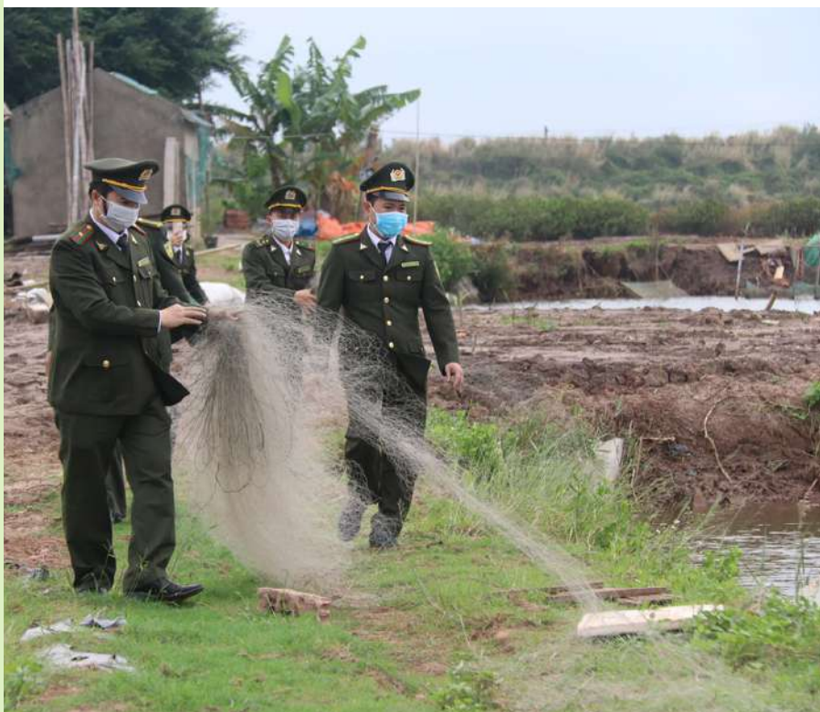
Forest Protection Department in Ninh Binh removing mist nets, with support from WildAct.